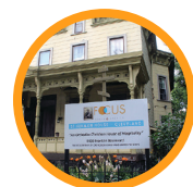
1977 St. Herman House of Cleveland established

2004 Orthodox Youth Outreach (later renamed YES) has its first weekend service-learning experience