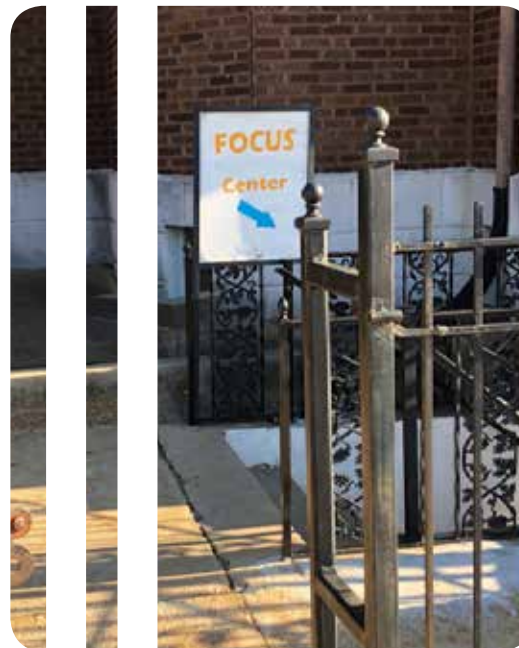
FOCUS Gateway City, St. Louis